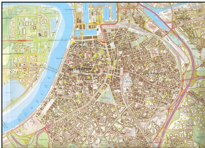
Figure 1: The City of Antwerp with on the left bank the neighbourhood Linkeroever

My perspective in this paper is one of an involved practioner. Since December 2006, I participate in the URS network of researchers 3 that works for the city of Antwerp. The commission of the City includes three neighbourhoods: Kievit - Zurenborg, Deurne Noord and Linkeroever. In this paper I limit my attention to the latter. URS developed its approach for 15 years in projects with residents, social workers and professionals of local administrations. Although the preliminary research in Antwerp questions inhabitants, schools, citizens, companies and other stakeholders, the participants of the training-sessions are only professionals from the city administration as this was stated in the commission. We will focus on this aspect in our concluding chapter.