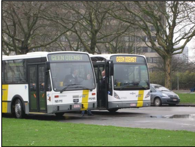
Figure 4: bus drivers at Linkeroever, waiting for the next ride

Linkeroever is specialized in giving a place to the 'informal', but in a specific, almost un-urban way. Linkeroever is the final stop of a lot of regional busses. Bus drivers have their break there. Regularly you see busses parking one beside the other and bus drivers talking with