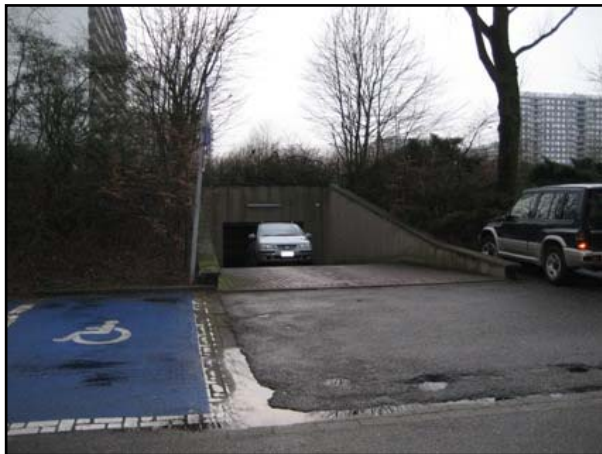
Figure 3: the entrance of one of the vast underground parkings at Europark

In one of these exercises people walked with closed eyes through the pedestrian tunnel below the river Scheldt. As a special structure the tunnel makes specific trajectories possible. It connects the two important living domains of inhabitants, the neighbourhood and the city