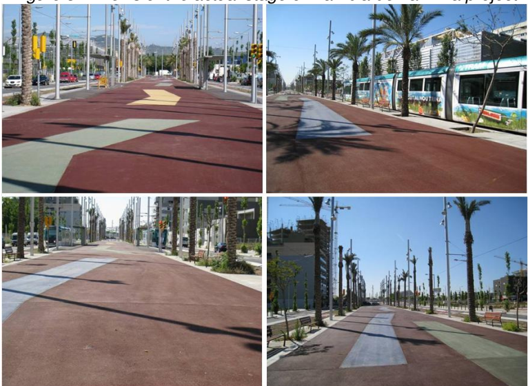
Figure 3 – Views of the actual stage of Rambla de La Mina project

To sum up, with the project Rambla de La Mina , there is the intention of creating a nucleus of strong symbolic relevance that can become a new urban centrality, promoting the connectivity with the remaining network of public spaces in Barcelona, namely, through green transport modes and even urban design solutions, based on principles of urban sustainability, contributing to a reduction in the city's carbon emissions.