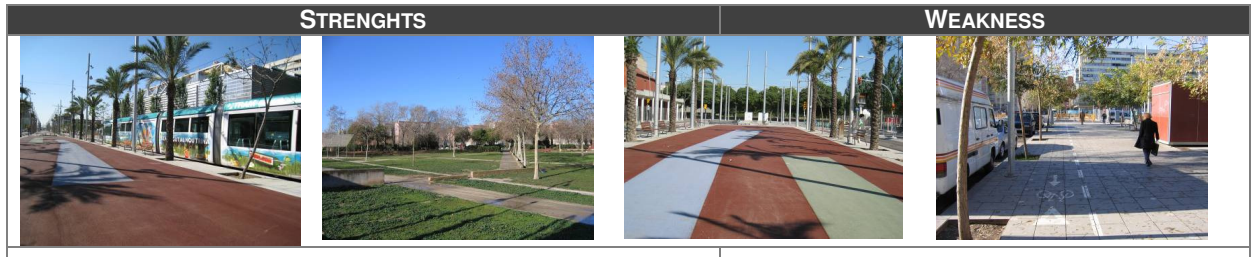
Table 1 – Synthesis evaluation of the public space Rambla de La Mina, concerning "Low Carbon Cities" criteria

Adequate insertion in the biophysical structure, positively contributes to the recovery and requalification of the waterfront and the Besòs river banks. [Biophysical integration]