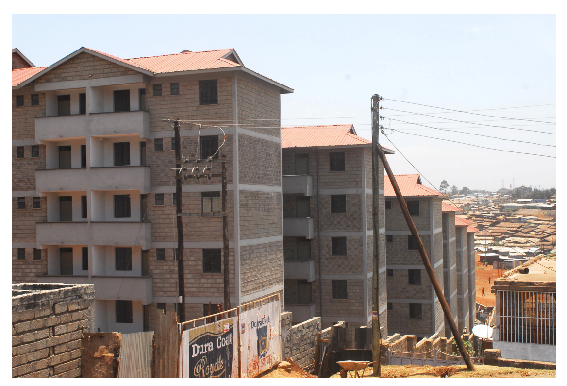
Plate 4-1: Slum Upgrading Project in Kibera

The government has put in place measures to improve housing in the metropolitan region. In Nairobi, for example, slum upgrading projects have been initiated in Kibera – Plate 4-1. Other housing projects are proposed in Mavoko, Kajiado, Ruiru and Thika. By 2012, the Ministry of Nairobi Metropolitan Development aims at investing about Ksh 3.4 trillion in housing development.