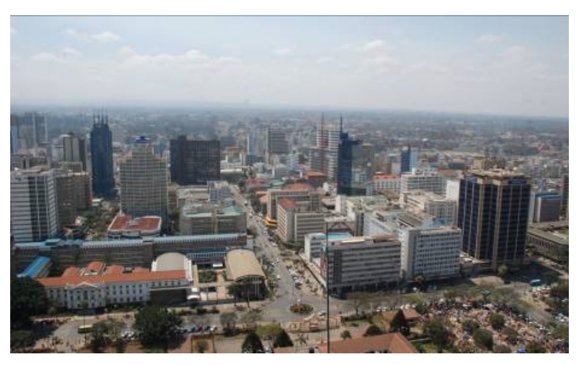
Plate 2-1: Business District: Nairobi - Established Central Business District

Nairobi and its metropolitan region are both the largest and well established commercial and industrial regions in East and Central Africa. Huge commercial establishments are found in Nairobi – Plate 2-1. Nairobi is also the home of huge manufacturing industries in the region.