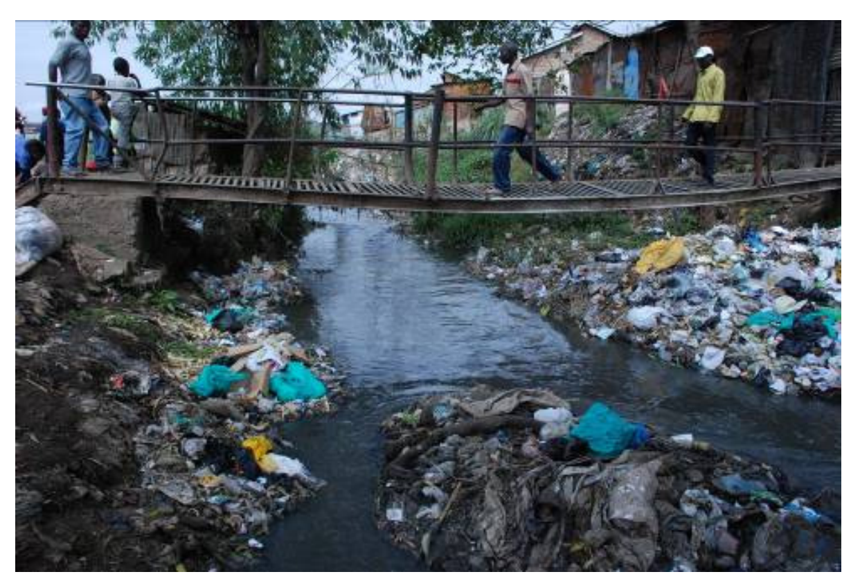
Plate3-2: Inadequate Waste Water and Solid Waste Disposal