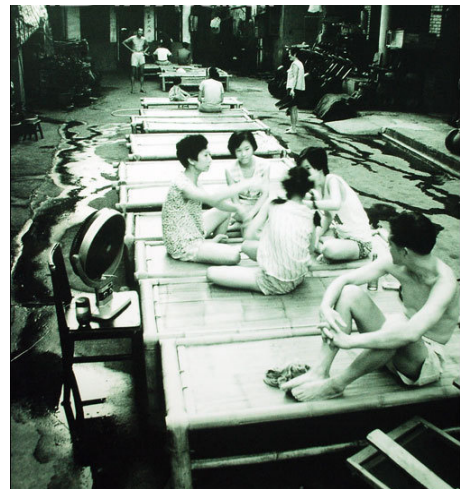
Fig 2. Wuhan summer night, 1990

People have also had a strong sense of belonging because they work in the same enterprise and they are closely bonded by their good neighborliness. People usually know each other very well and there are frequent contact with each other. Despite of the relative low living standard of the people, a sense of equity in the community made life inside of a working-unit at the time quite satisfying for most people. One of the most representative and memorable urban life images of the time is families spending summer nights outside of their houses on bamboo bed (Fig 2).