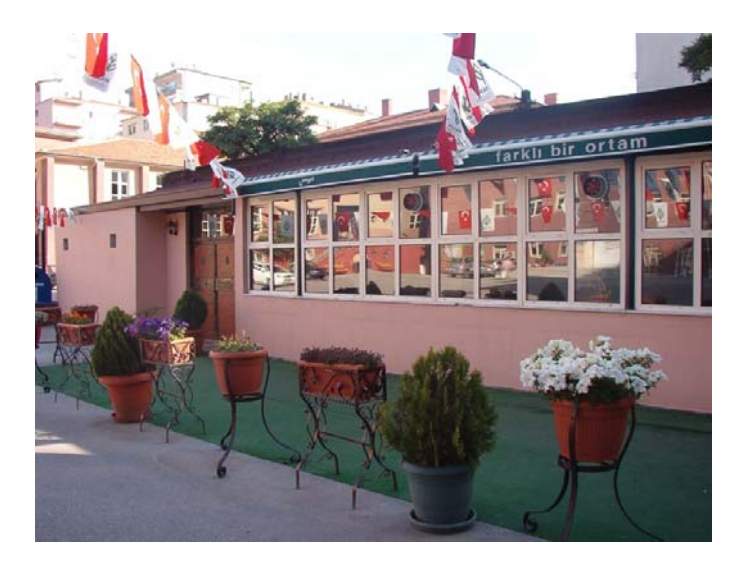
Figure 3. Çengel Cafe

In Çengel Café there are 13 young people who are able to be educated make all the services. In the Café, all is regulated by the colors and the employees learned all by the means of colors. The table clothes and objects on the table are in the same colors and the responsibilities are distributed according to these colors for providing the order (Figure 3). This project has been awarded by Local Governments Association in November 2005.