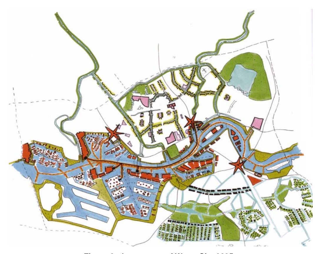
Figure 2: the concept of Water City 2035

For the water management task the concept Water City 2035 is based on the (nearby) future situation that the climate is changing and the average temperature is gradually increasing. Also in future times the wet and dry periods will be longer. This causes more and more intensive showers so the sewers and the surface water like the river and the canals can hardly manage the incoming water. That is why the water management system will reach its limits. On the other hand Rotterdam also deals with ground water problems. The soil is sinking because the northern part of Rotterdam is built on peat. An other problem is the rising of the seawater. If this will be more than the estimated approximately one meter during this century it won't be a problem, but if the sea rises more it will be. Summarizing: Rotterdam deals with four different types of water: water from the sea, water from the river, rain showers and water from the soil. These four types of water have their own management system. Water from the sea comes together in the river system. This is lain in the outer dike area. The second system is the inner polder system that is influenced by the water from the rain showers and the soil. The dike manages (and protects against) the water from both these systems.