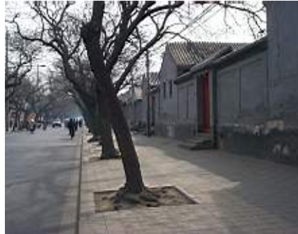
The hutong's color

and walk a pair of rows car of hutong, establish to lead to go the marking, lead the mobile car into hutong, have already make sure to plan 30. But, this decision actually can be carried out? Can let hutong become "bridge" that breaks through "tiny circulation" of the city transportation? To the integration that hutong protects whether beneficial?