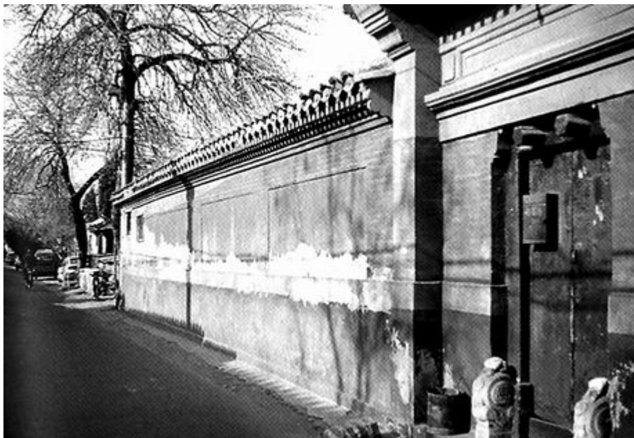
Green 's problem

Beijing hutong is green to turn the system not integrity. Existing have some ancient trees, but, protect not good. Because hutong the width is not enough, be in need of green turn with the ground.