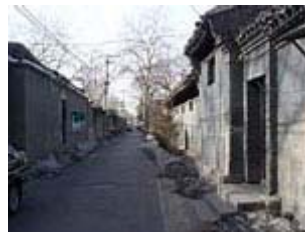
Beijing hutong's protect

Along with the development that modern city construction, Beijing hutong is the quantity in the gradual decrease. How we are the loss that the decrease hutong? This need we must against time hutong of category, age, protective degree carry on the classification, tidy up the which hutong is the point protection object; Which hutong is a point protection object; Which hutong can protect with the internal integration, exterior? Thus, a pedestal of government policy give protection, can reduce the loss.