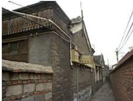
Beijing hutong's protect

complicated degree of Beijing hutong are all well-known in the whole worlds. Therefore hutong break through the decision of the city transportation" tiny circulation" and should go carefully, because of, hutong is not the valid road transportation resources.