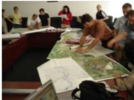
A visioning workshop in Mitrovica.

In the Urban planners 4 from all 30 municipalities of Kosovo participated in an advanced training programme on strategic and spatial planning which offered an opportunity to learn from experiences of other countries in the region. The workshops were developed and conducted by international and local trainers and experts prepared the municipal planners to deal with these issues in their own municipality. Training materials developed for these purposes and closely linked to the planning process reflected in the Law on Spatial Planning are in the final stage of printing and will be soon available on the UN-HABITAT's website 5 .