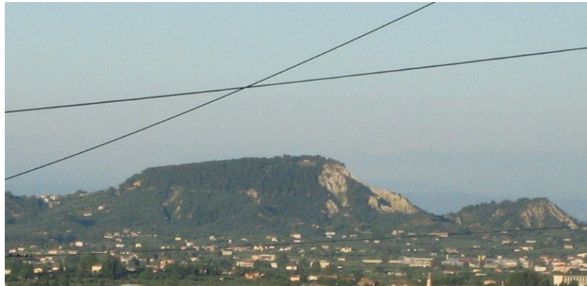
Photo 1. Zakynthos / Ionian Islands, landscape type 1b (personal archive)