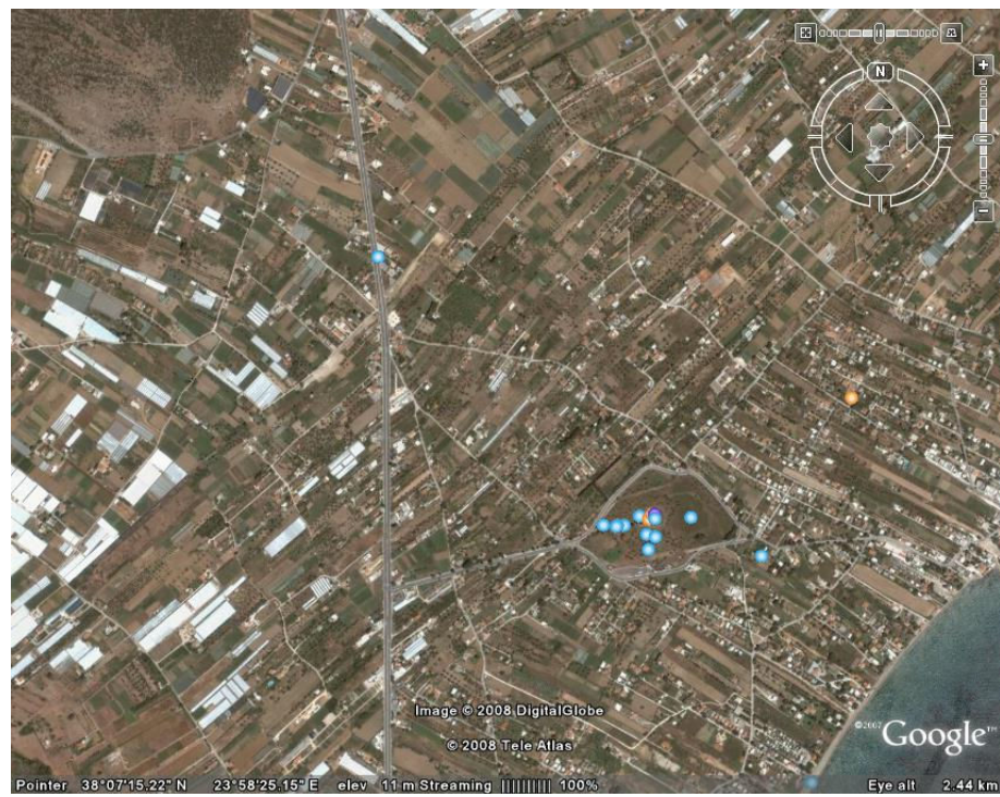
Photo 4. Attika- Marathon tomb place. Landscape type 2b (Google 2008)