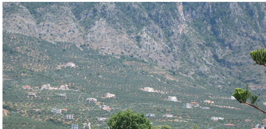
Photo 2. Kalamata / Peloponnese, landscape type 2b