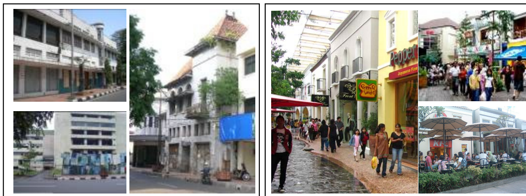
Figure 5. Left: Shops and former mall in the city center which no longer used and maintained Right: New pedestrian malls concept in outer skirt of city center, attract more people