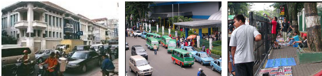
Figure 4. Traffic congestions and numbers of informal street vendors and trades in Bandung's inner city

within the city centre. Firstly, the reason is due to most of middle-income class who lives in the outer skirt of Bandung is car dependence, and they have to travel with the car to their workplace or doing some business activities in the inner city. In addition, the means of public transport from the outer skirt to inner city is not properly organize and comfortable. Secondly, the low-income class set up their housing on the marginal land in the inner city and most of them work in the informal sector activities, such as street vendors and traders. The numbers of informal street vendors, which occupied the public spaces and street also cause traffic congestions in the inner city. These phenomenons give a tendency to a decrease of quality in commercial activities in the inner city (Figure 4). The decrease of quality in these area is an indication of a decline in the function of a city centre that could be caused by an overflowing economy activity where the commerce activities are decentralized into the city outskirts area (Berry and Pradoto 1999, Andita, 2008) (Figure 5). Cuthbert (2006) also noted, "Historic areas such as Alun Alun Square and Braga, the old heart of the city, have become isolated and have lost their value as nodal public spaces ..."