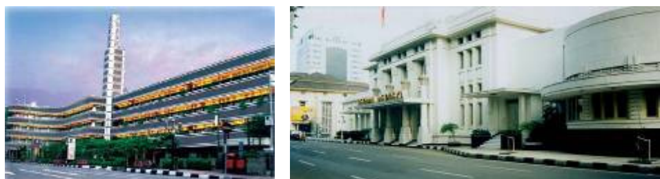
Figure 6. Art Deco Buildings in Bandung's Inner City

Bandung city is famous by its Art Deco building style which is an inheritance left by the Dutch after the colonial time (Figure 6). Indeed, it is an asset for Bandung city to have these buildings as a commodity to attract tourists. Those Art Deco buildings mostly located within the inner city, thus it makes inner city rich with historical site. The existence has to be utilized and maintained considerably going along with a proper management system. At the moment, Bandung has a local organization that concern about the heritage buildings and pursues Bandung's local government to conserve and preserve it, the organization called Bandung Heritage Society .