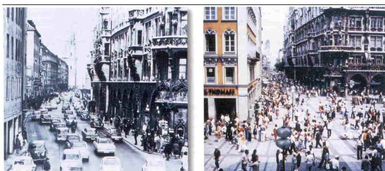
Figure 1. Before and after Munich's main square, Marienplatz, was pedestrianized in the 1950s