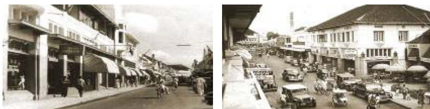
Figure 7. Braga Promenade and Streetscape, Bandung City 19 th century